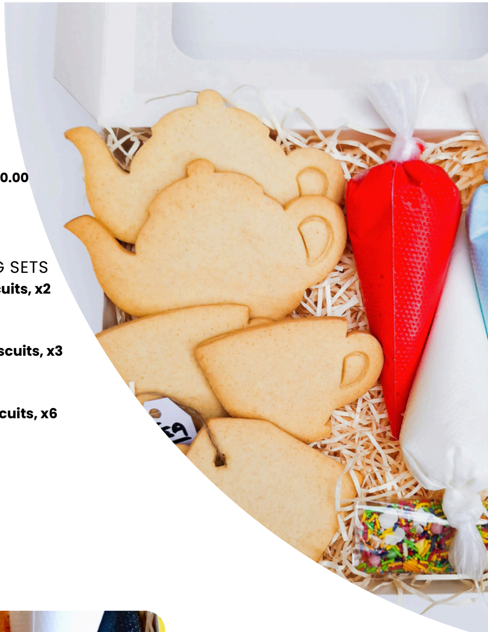
Themed cookie decorating kit