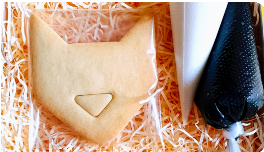
Logo cookie decorating kit