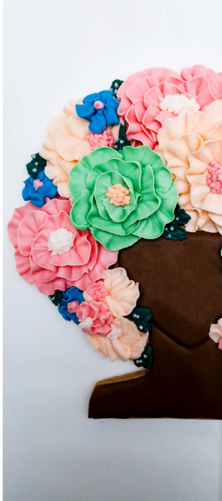
3D Sugar Cookie

Years of baking and logistical experience means we're able fulfil a wide range of orders, from small bespoke sets of 6 to over 10,000 individually wrapped biscuits.